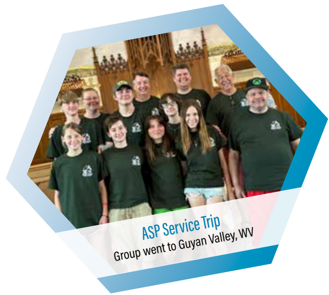
ASP Service Trip Group went to Guyan Valley, WV

Confirmation is flourishing, with attendance steadily growing and sessions tripling in frequency to meet the enthusiasm of our youth.