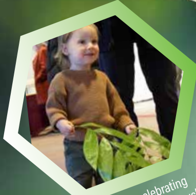
Hosanna, celebrating Palm Sunday and Jesus' entrance into Jerusalem.