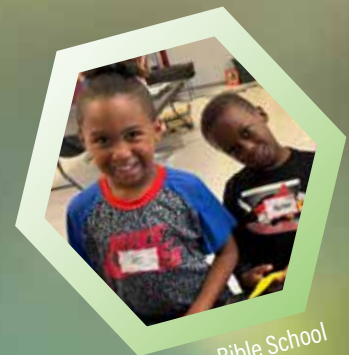
Vacation Bible School hosted over 150 children sharing God's love.