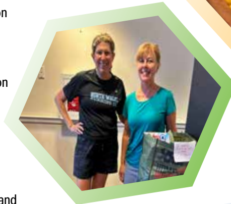
Summer food bags presented to the Bean Bag Food Program.