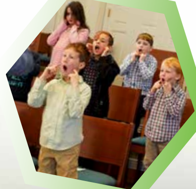
Trinity's Music Camp shared the love of music with 23 children.