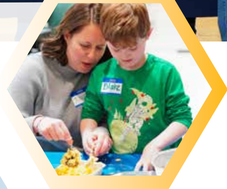
Tree Lighting craft stations for families.

"Trinity has the most welcoming community of activists for good in this world. All are welcome in "Sharing God's Love."