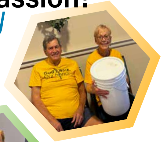
Flood Bucket collection during God's Work, Our Hands Sunday.

This vital meal and food pantry ministry continues to grow, feeding both bodies and spirits in our community. Every Monday night, volunteers prepare meals and share kindness with all who enter. Feast allows our guests to share their stories, fostering mutual growth and understanding. In 2024, over 9,000 meals were served, planting seeds of kindness and connection.