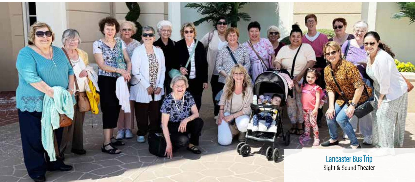
Lancaster Bus Trip Sight & Sound Theater

We honored our volunteers with a bagel bar and flavored coffee, celebrating the many hours of service.