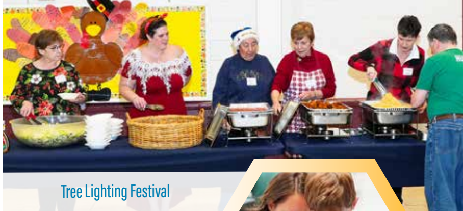
Tree Lighting Festival