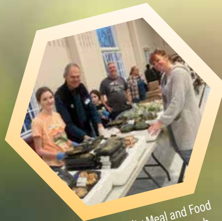
Feast Community Meal and Food Pantry serves thousands each year on Monday nights.