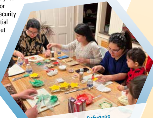
Afghanistan Refugees The family making cookies together

The Outreach Ministry Team is a powerful force for addressing food insecurity and providing essential assistance throughout the community.