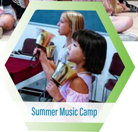
Summer Music Camp