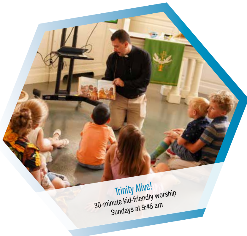
Trinity Alive! 30-minute kid-friendly worship Sundays at 9:45 am