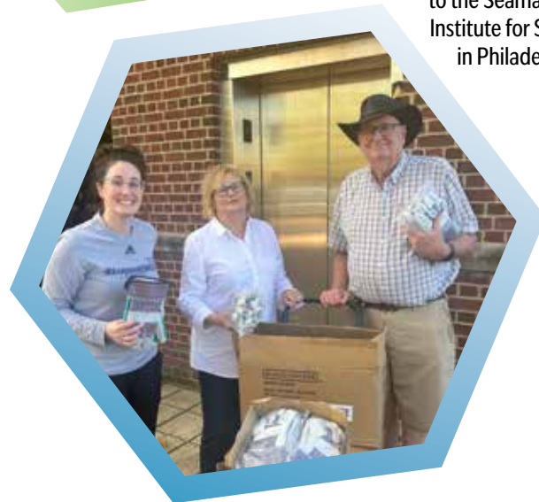
Delivering work gloves to the Seaman Church Institute for Seafarers in Philadelphia.