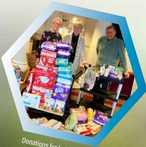
Donations for babies and toddlers delivered to Mitzvah Circle Foundation.