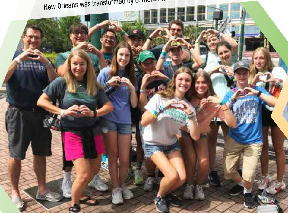
ELCA National Youth Gathering New Orleans was transformed by Lutheran teens and chaperones

"ASP was the official start of my faith story. I cherish the opportunity to build friendships with my team and the homeowners while learning invaluable life skills—siding a house, fixing floors, and even safeguarding newborn kittens."