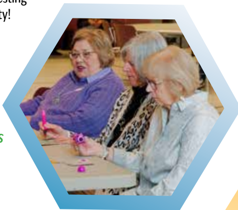
Monthly Trinity Seniors gather for a luncheon and a program such as BINGO!