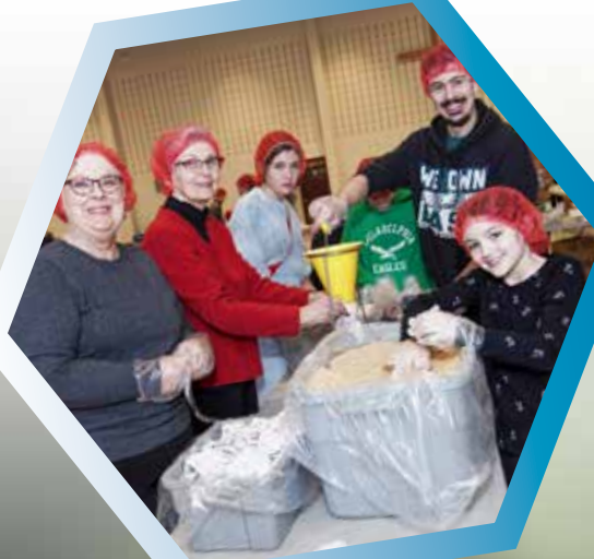
Over 130 volunteers packaged 15,120 meals for Rise Against Hunger on MLK Day of Service.