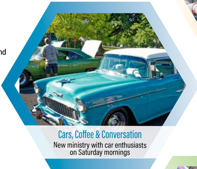
Cars, Coffee & Conversation

New ministry with car enthusiasts on Saturday mornings