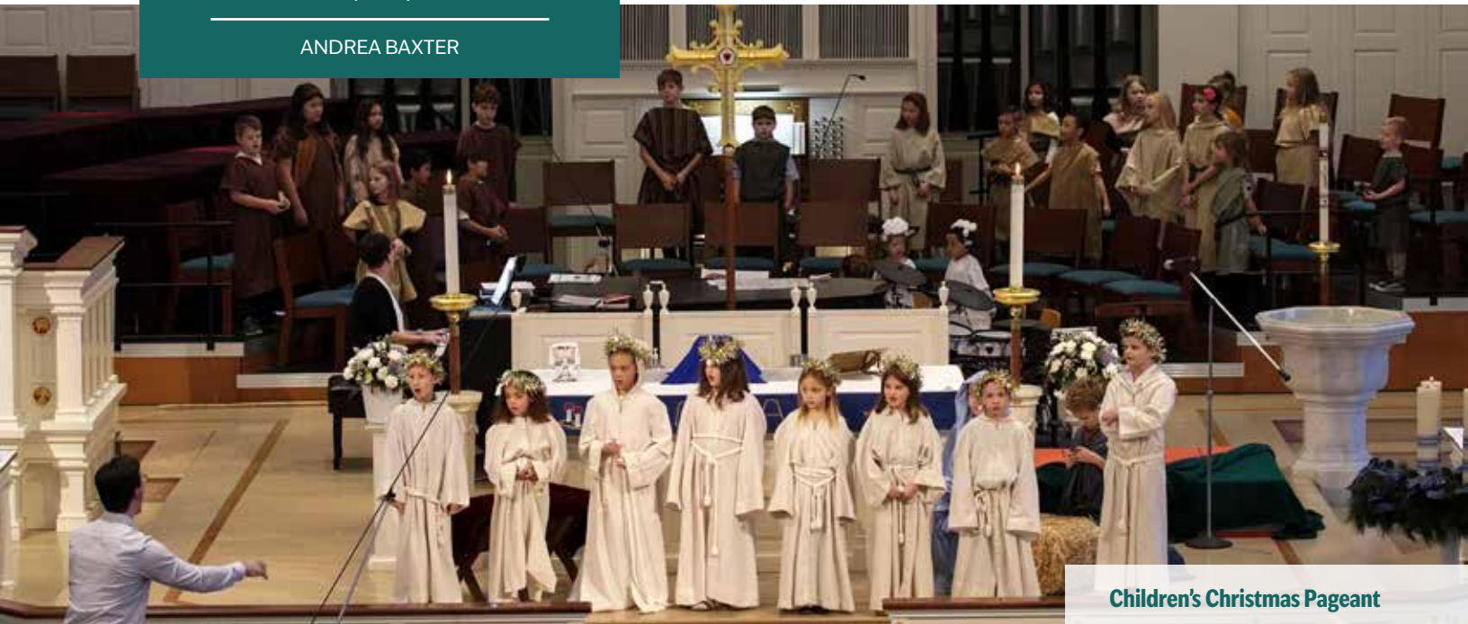
Children's Christmas Pageant

The culmination of the camp was an opportunity to help lead the closing worship service for the Association of Lutheran Church Musicians (ALCM), held at Trinity on July 8. We are hoping to build on this first positive experience, and so camp will be held again the week of July 8-12, 2024.