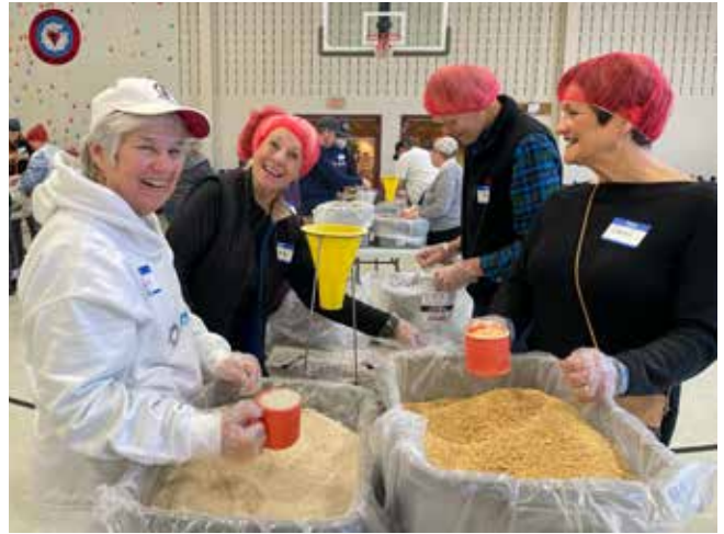
Trinity's Endowment Fund provided the funding for the MLK Day of Service with Rise Against Hunger. We packaged 10,000 meals with 85 volunteers in Hyson Hall on January 16, 2023.