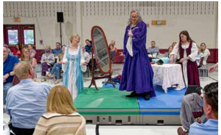
Generosity Team partnered and supported the musical and dinner theater "To the Castle" in January 2023.